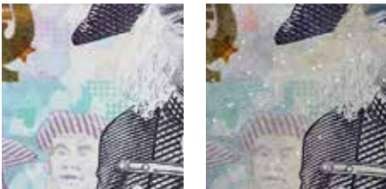
StarPerf® consists of microperforations, which can vary in size and shape, and which are arranged in a denomination-specific pattern.

StarPerf® can easily be integrated into any banknote design, as it is completely invisible in reflection. Only when the note is held against the light, the perforations become clearly visible.