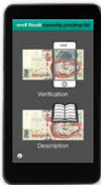
Step 2: The user can choose between the «verification» or «description» mode. To verify the banknote, the user selects the «verification» button.