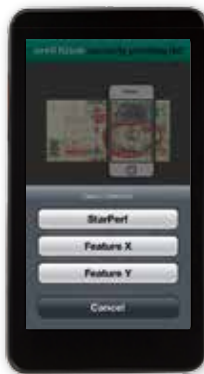
Step 3: The user selects the StarPerf® App