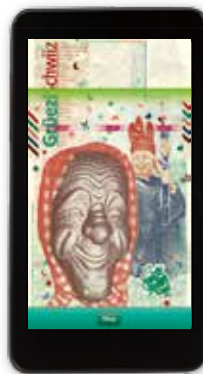
Step 4: The smart phone scans the banknote for the StarPerf® pattern