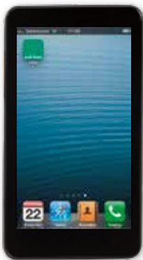
Step 1: The user starts the App

As the App can identify distinct denominations, it becomes possible to explain further security elements and other features of the specific banknote in the App, by displaying text, pictures and animations. Hence, smart phones become a very powerful platform for the education of the public.