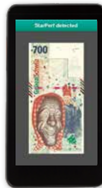
Step 5: A confirmation is displayed upon the successful detection of StarPerf®