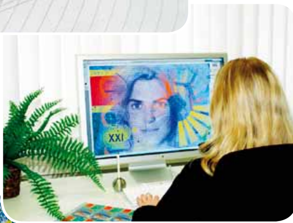
Computer Aided Origination