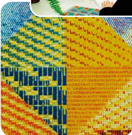
High-precision intaglio printing and clear microletters