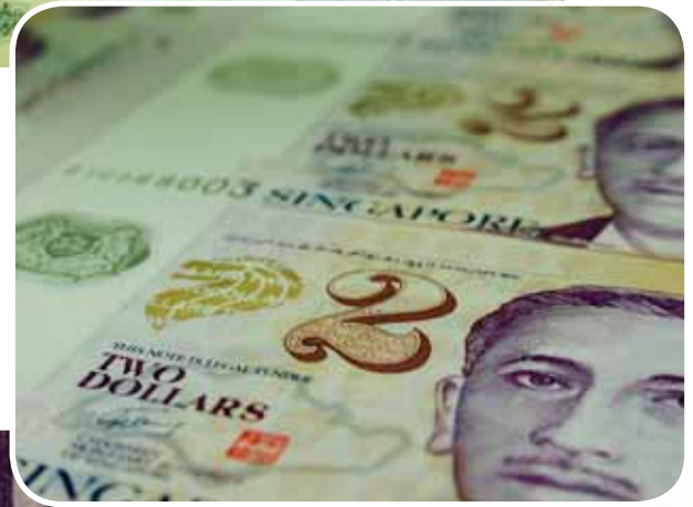
Quality printing on polymer substrate