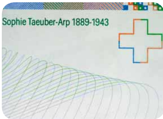
Orlof technique in Simultan Offset

By their very nature, banknotes must never compromise on quality. It must be kept at a consistently high level to deter forgery attempts and to preserve public confidence. All banknotes produced by Orell Füssli Security Printing Ltd are printed in Switzerland and meet the highest quality standards. In order to ensure that this remains so, we continuously invest in leading-edge technology along the production chain and employ highly skilled personnel to operate the equipment.